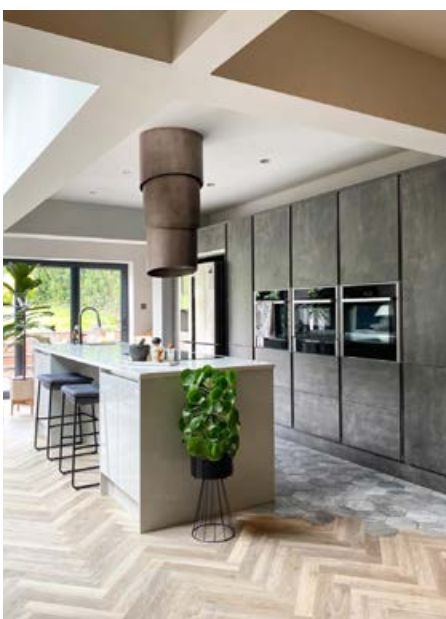
Pareo (Island Hood) @palominohome