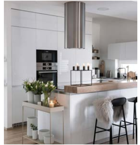
Cylindra Isola (Island Hood) @ kajastef

Looking for kitchen inspiration? Take a closer look at real customer kitchens showcasing Faber in beautifully designed spaces.