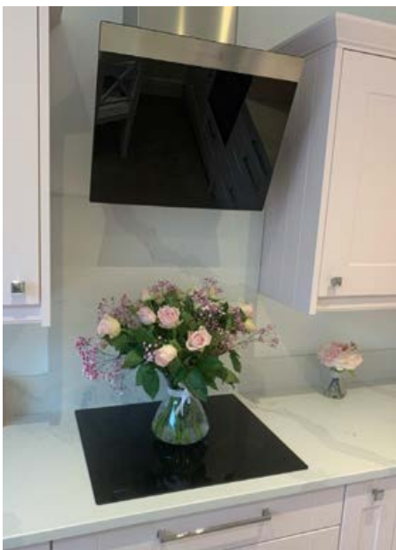
Daisy B (Island Hood) @henllyshouse