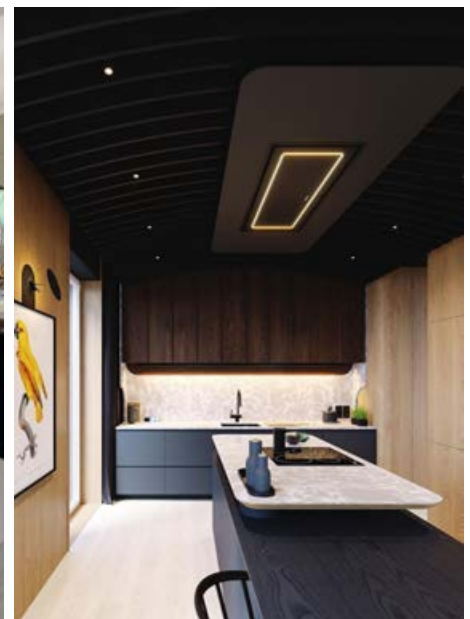
High-light (Ceiling Hood) @zarysy.pl