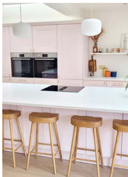
Galileo Smart 60 (Venting Hob) @_talkinboutmyrenovation_