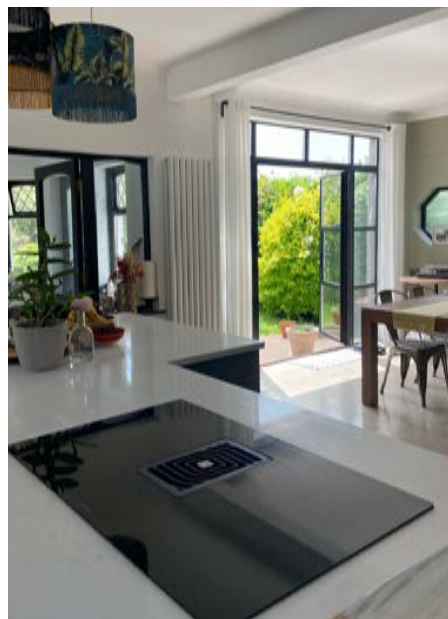
Galileo (Venting Hob) @ourwestfieldbungalow